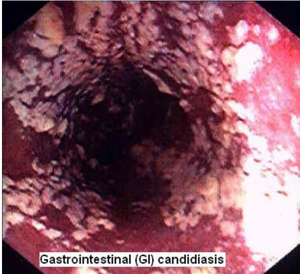
Gastrointestinal (GI) candidiasis

The problem is not Candida Albicans itself, but the overgrowth, reducing immunity, that can no longer control the growth of this yeast (fungus). This yeast is needed as a part of normal gut function, mainly as food for the good bacteria, like acidophilus, but this overgrowth is what causes the many problems, from allergic reactions to leaking, smelly ears.