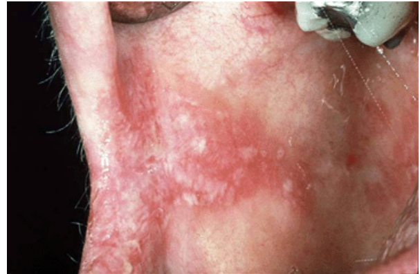
Candida Albican overgrowth in mouth ( www.whocollab.od.mah.se/expl/oralmuc.html T)

and ears, as well as Candida albicans, which is a part of a normal digestive tracts microflora.