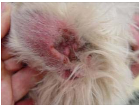
Malassezia pachydermatitis in a Westie's ear

Usually in all methabolic problems we begin our search within the gut. How effective the digestive tract in reality is in your dog? Most of the problems can be addressed right there. If the digestive tract does not function properly, the pet will not be able to utilize nutrients from the food it eats, its body cannot function, which results into all kinds of symptoms and potentially the body just crumbles and decays.