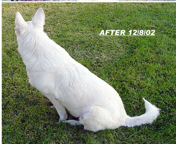
Yeast infection – before and after treatment

http://www.greatdanelady.com/articles/feed_program_for_systemic_yeast_problems.htm